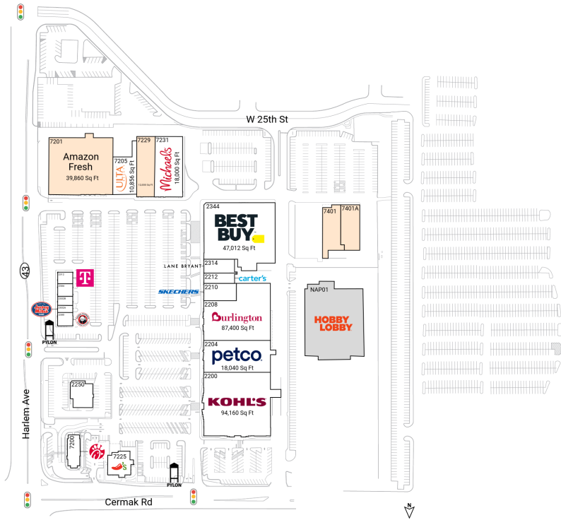
North Riverside Park Mall